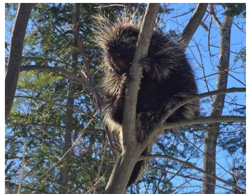
Every acre is Precious! Protect ALL of FISP!

Join us on Facebook: SaveFishermansIslandStatePark