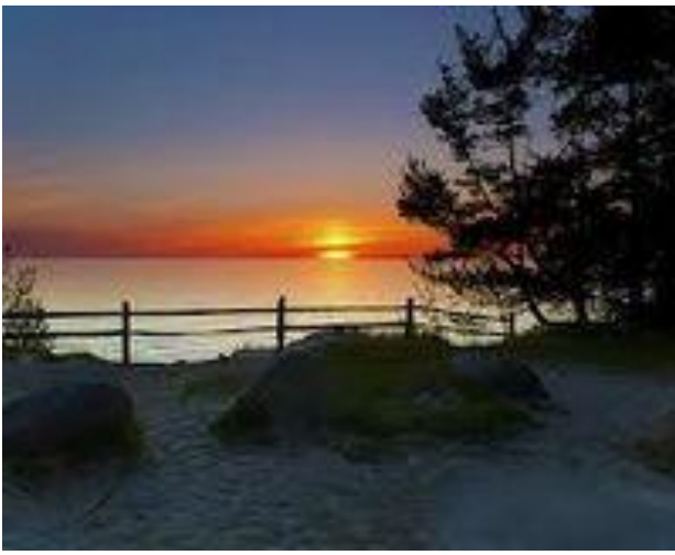
Fisherman's Island State Park Bells Bay Rd. Overlook